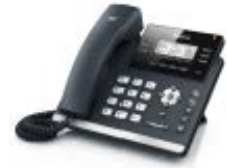
Yealink T4 series